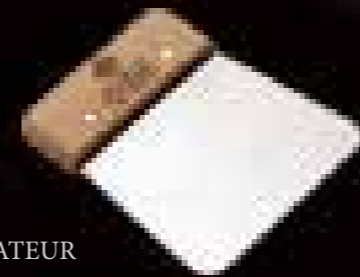
"VENETIAN CLAY" PLASTIC FLOAT